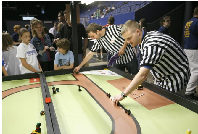
2009 RCX Mat and Competition at STLP State Championship