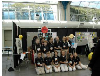
Mt. Sterling Elementary School, Best of Kentucky Showcase 2006

These schools represented STLP at ISTE and NECC from 2006-2011. All were named Best in State during State Championship.